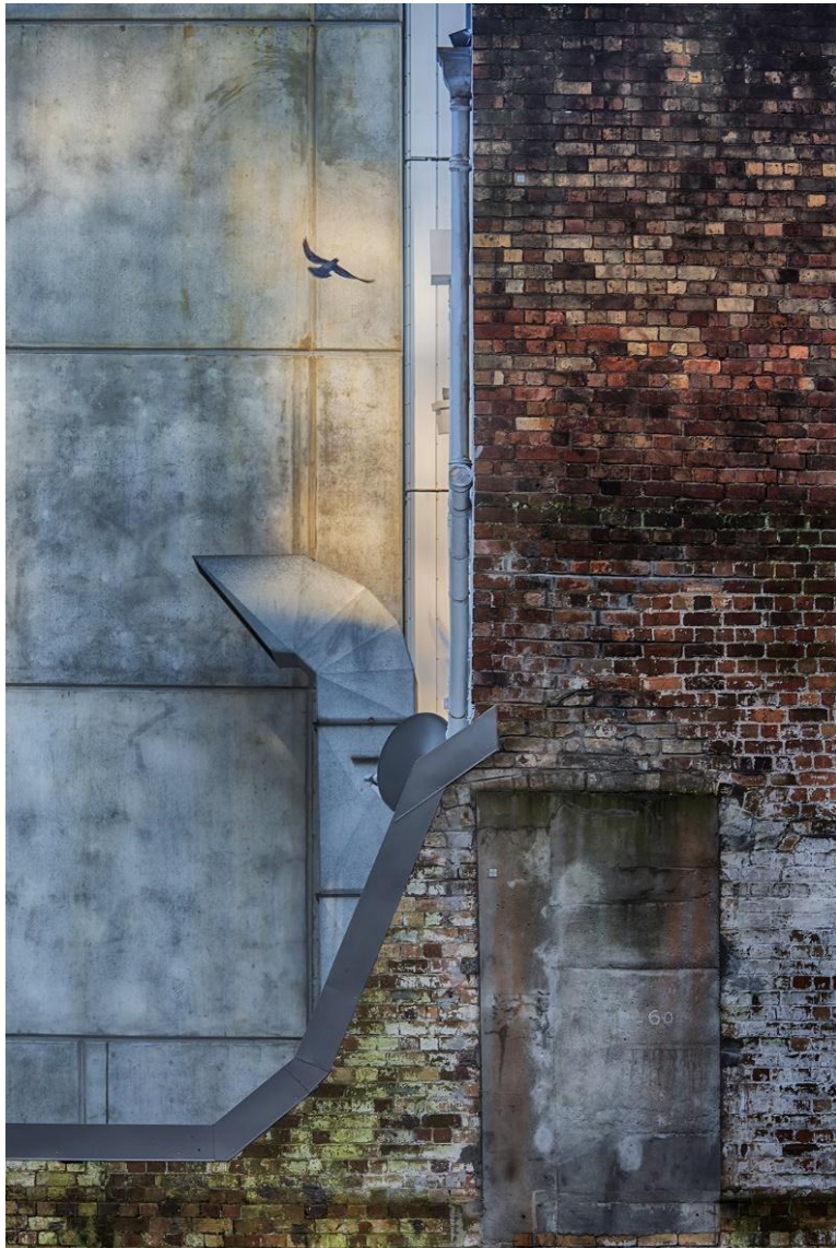
Third place: Roy Cernohorsky, Flying to The Light Prize – FUJIFILM X-T200 XC15-45mm Kit Dark Silver

Judges' comment: "A beautifully balanced composition, speaking of past and present urban environment, using the light and colour palette to create a work of art from the everyday views."