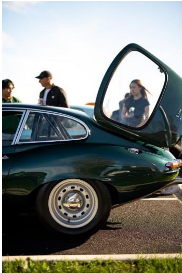
3rd place - Best new U25 - Nathan Smith - Jaguar - Best New U25 Prize 2025 Auckland Photo Day

unfolding story. The judges appreciated how it reflects the rich multicultural character of the City of Sails."